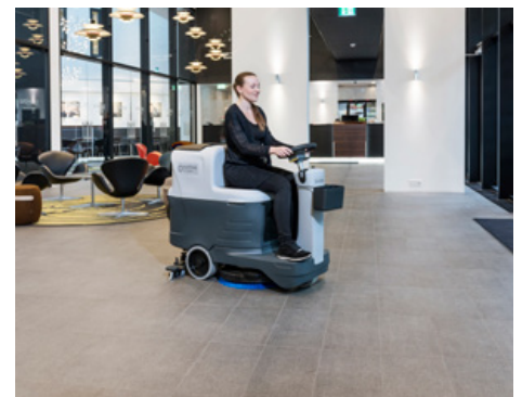
Quiet mode lowers the already quiet level of 68 dB A to an astonishing low 62 dB A.