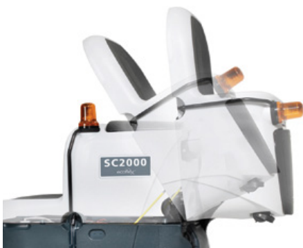
Recovery tank fully tiltable gives easy access to battery compartment and EcoFlex™ System.

Hotels Schools Hospitals Restaurants Sports Centers Supermarkets Shops Offices