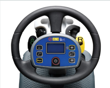
Extremely user friendly and easy to learn. Dashboard with One-Touch button and intuitive display integrated into the steering wheel.

Conventional automatic scrubbers tend to apply more water and cleaning solution on the floor than what is needed, especially when maneuvering around obstacles, slowing down on turns or cleaning along edges. SmartFlow™ technology eliminates extra solution dispensing by automatically reducing the solution flow rate when the machine is slowed down, extending the productivity per tankful. With larger tanks and less solution dispensed, operators will extend the time between dump and refill cycles by as much as 50%. The use of less solution with SmartFlow helps eliminate waste and more importantly, lessens the risk of slip and fall incidents within the facility.