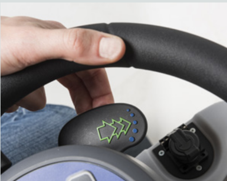
EcoFlex™ System allows for flexible detergent settings with a chemical free cleaning mode and burst of power for powerful spot cleaning at the touch of a button.