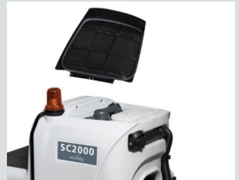
Easy to clean with recovery tank lid completely removable. (Shown with optional safety beacon light)