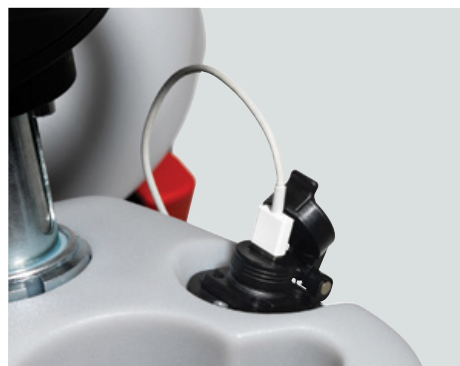
Optional USB port for charging cell phones and other small electronics.