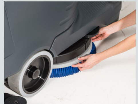
Tools-free removable brushes or pads.