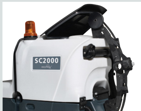
Built-in squeegee hanging system on tank allows for safe transportation through doorways and tight areas, while permitting tank drying.