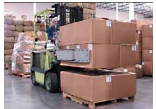
Arms in vertical position for clamping.

Cascade's TURNAFORK™ handles a wide variety of loads.