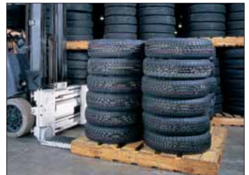
Arms in fork position for pallet handling.