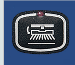
Pad drive click-off