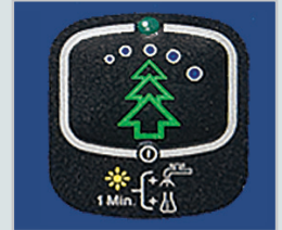
EcoFlex™ System "burst of power" mode